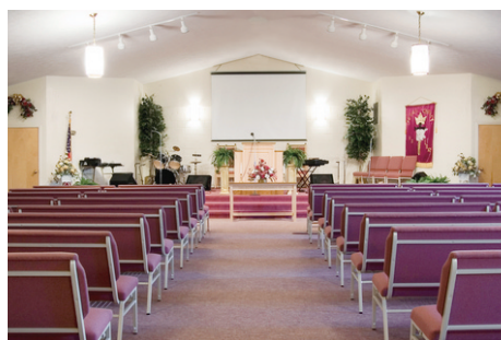
Houses of worship